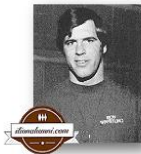
Class of 1967 50th Reunion - Ilion Days Weekend

The milestone reunion being celebrated, during Ilion Days in 2017 year, is for the Class of 1967. On Friday, they plan to get together downstairs at the Elks Club at 7:30 or after the Doo-Dah parade for some refreshments and laughs.