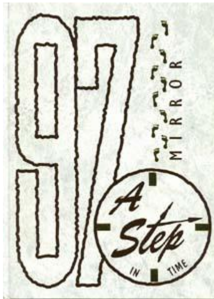
Class of 1997 20th Reunion - Iliion Days Weekend

The Class of 1997 will host their reunion at the Moose Club on Friday July 21st, from 8-12 PM. Cash bar and cost is $25 per person / $40 a couple and payment will be taken at the door! "Since our class was one that hung out with many others from other grades they are more than welcome to attend. However, they will also be charged. Hope to see some of those from 1996 & 1998!"