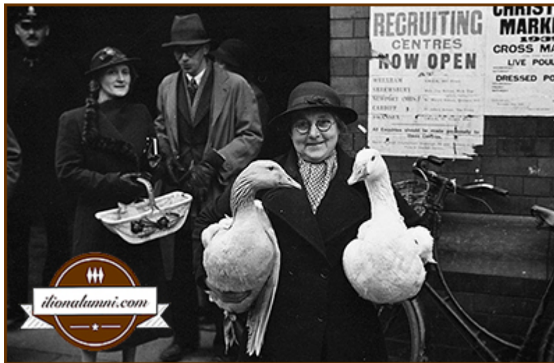
Anonymous woman with geese

stopper. When Mother Goose takes the young ones for a stroll and they waddle along after her in single file, imitating her every move, even truck drivers come to a halt along Otsego Street ... and to make sure the little ones don't get hit. - June 29, 1954 - The Ilion Sentinel - Iillion NY Sentinel 1954 Jan-Aug - 0462.pdf