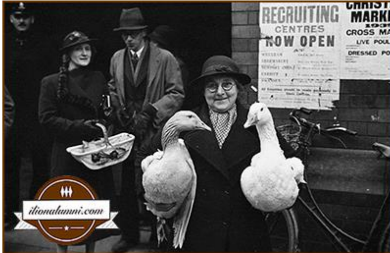
Anonymous woman with geese

her every move, even truck drivers come to a halt along Otsego Street ... and to make sure the little ones don't get hit. - June 29, 1954 - The Iliion Sentinel - Illion NY Sentinel 1954 Jan-Aug - 0462.pdf