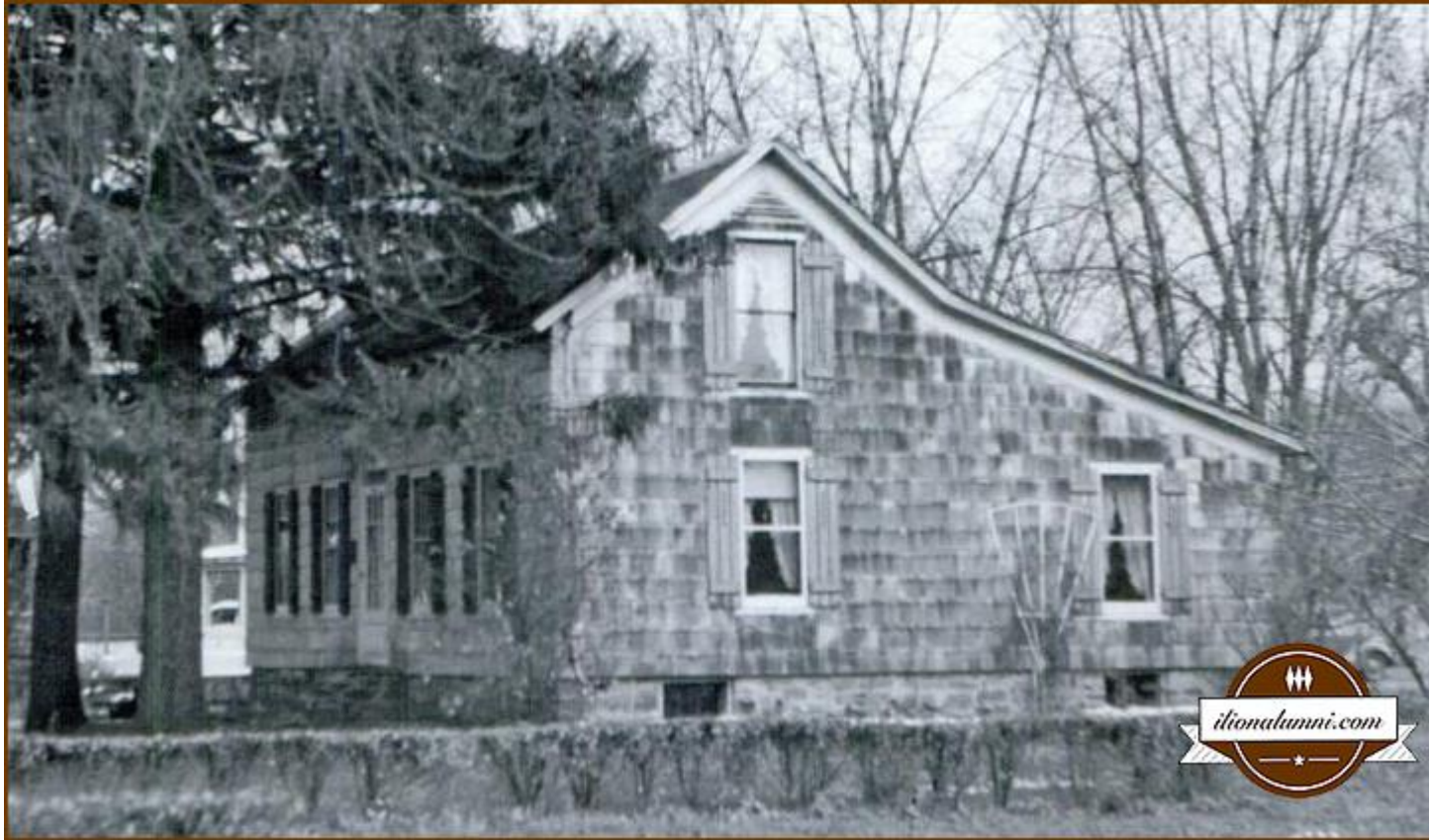
Clapsaddle House - Corner of Otsego and Richfield Streets, 421 Otsego Street, Iliion NY