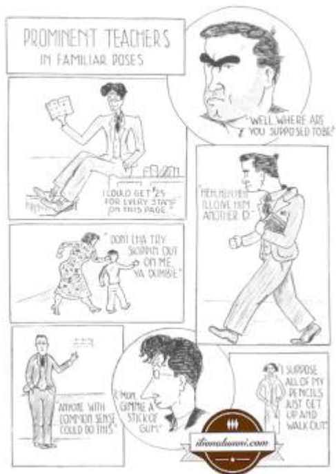
1936 Jack Caswell's caricatures of fellow students and faculty.