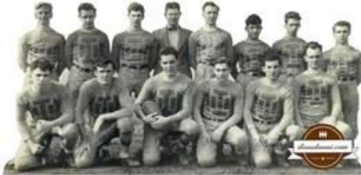
Iliion 1935 Football Team"